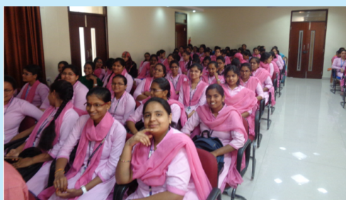
Students in the newly introduced dress code

Our students feel safe and secure 24x7, thanks to the new Surveillance Cameras installed all around . No escape for the students and no way to trick your teachers, the Management has introduced Biometric attendance for regulating student's attendance. Similarly to bring ONENESS among students UNIFORM DRESS for students is introduced