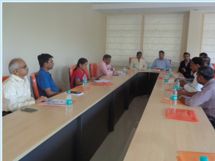
One day seminar on Internships for technical graduates by Turnin.