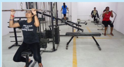
Students using the Gym room