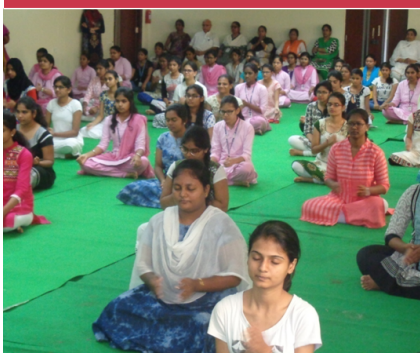
Students of SNVPMV participating on the occasion of International Yoga day-2018