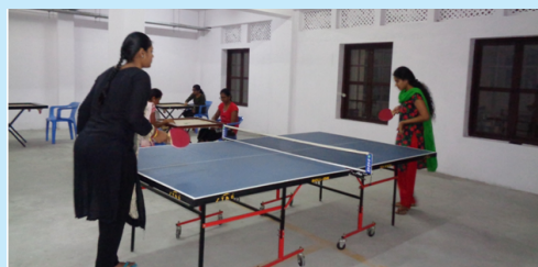
Students playing Table Tennis and Caroms in the Sports Room