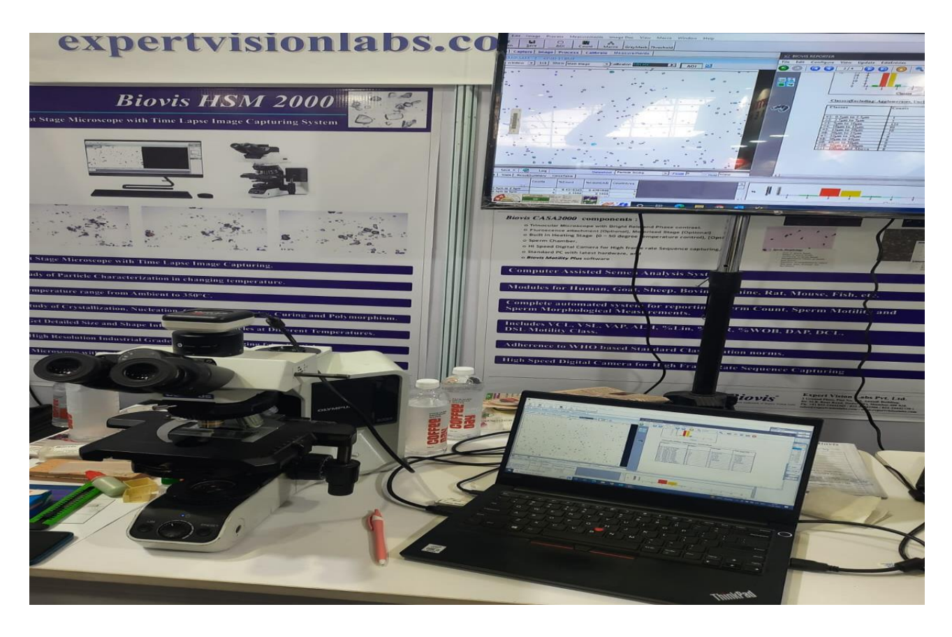
{\bf BIOVIZ: Partical\ Size\ Analyzer} (can\ give\ frequency\ size\ distribution\ )