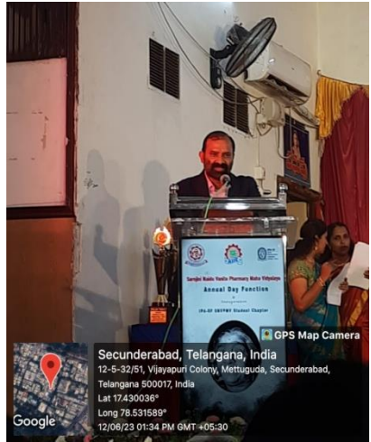
Secunderabad, Telangana, India 12-5-32/51, Vijayapuri Colony, Mettuguda, Secunderabad, Telangana 500017, India Lat 17.430036° Long 78.531589° 12/06/23 01:34 PM GMT +05:30