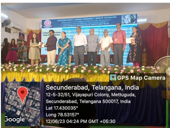
Secunderabad, Telangana, India 12-5-32/51, Vijayapuri Colony, Mettuguda, Secunderabad, Telangana 500017, India Lat 17.430035° Long 78.53157° 12/06/23 04:24 PM GMT +05:30