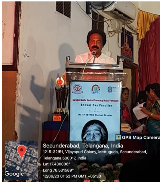
Secunderabad, Telangana, India 12-5-32/51, Vijayapuri Colony, Mettuguda, Secunderabad, Telangana 500017, India Lat 17.430036° Long 78.531589° 12/06/23 01:52 PM GMT +05:30