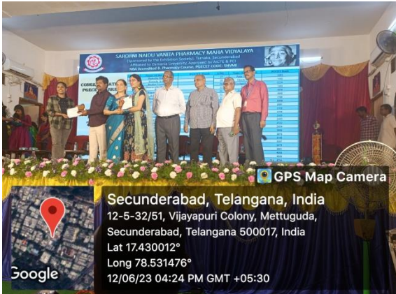
Secunderabad, Telangana, India 12-5-32/51, Vijayapuri Colony, Mettuguda, Secunderabad, Telangana 500017, India Lat 17.430012° Long 78.531476° 12/06/23 04:24 PM GMT +05:30