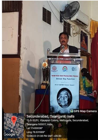
Secunderabad, Telangana, India 12-5-32/51, Vijayapuri Colony, Mettuguda, Secunderabad, Telangana 500017, India Lat 17.430036° Long 78.531589° 12/06/23 01:38 PM GMT +05:30