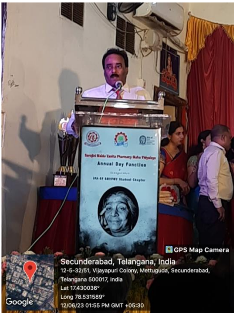
Secunderabad, Telangana, India 12-5-32/51, Vijayapuri Colony, Mettuguda, Secunderabad, Telangana 500017, India Lat 17.430036° Long 78.531589° 12/06/23 01:55 PM GMT +05:30