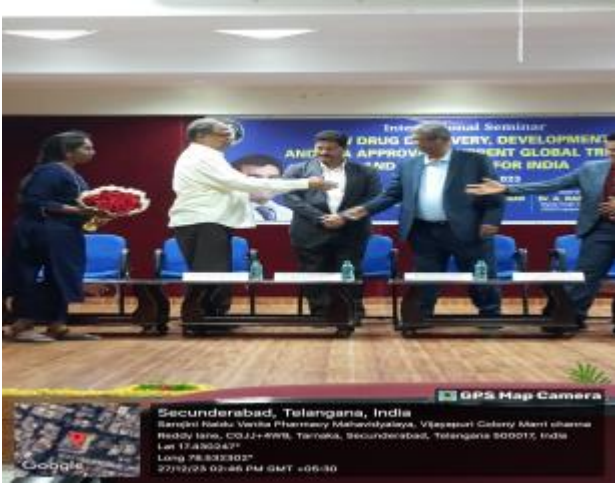
Secunderabad, Telangana, India Sarojini Naidu Vanita Pharmacy Mahavidyalaya, Vijayapuri Colony Marri channa Reddy lane, CGJJ+4W9, Tarnaka, Secunderabad, Telangana 500017, India Lat 17.430247° Long 78.532302° 27/12/23 03:46 PM GMT +05:30