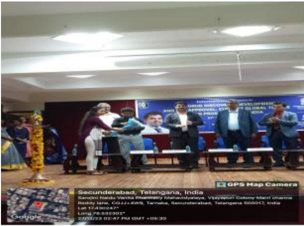
Secunderabad, Telangana, India Sarojini Naidu Vanita Pharmacy Mahavidyalaya, Vijayapuri Colony Marri channa Reddy lane, CGJJ+4W9, Tarnaka, Secunderabad, Telangana 500017, India Lat 17.430247° Long 78.532302° 27/12/23 03:47 PM GMT +05:30