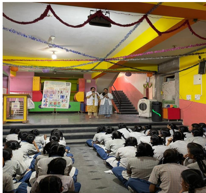
An awareness lecture on good touch bad touch along with a role play was taken.