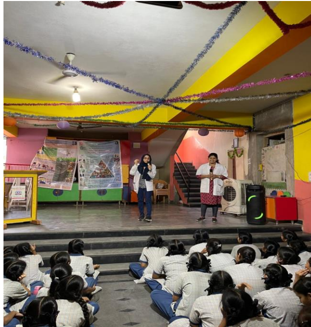
An awareness lecture on food habits and nutritional diets was taken.