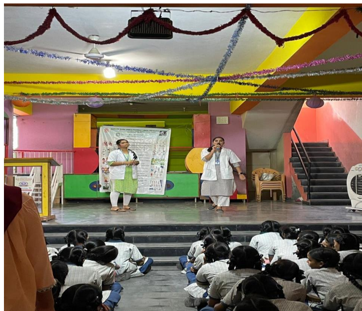
An awareness lecture regarding physical activities along with breathing exercises and physical fitness was taken.