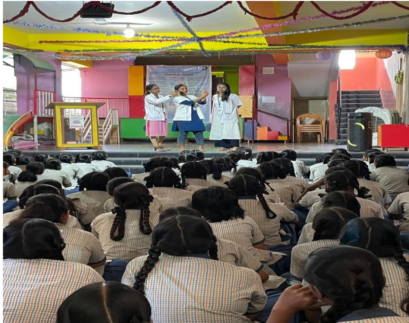
An awareness lecture regarding menstrual health, menstrual hygiene and care along with demonstration of use of menstrual cups and sanitary napkins was taken.