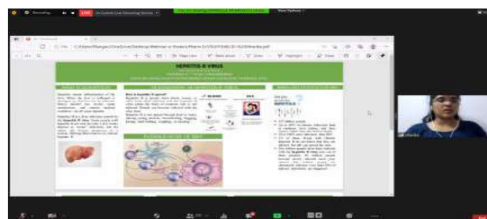
Poster presentation by the student