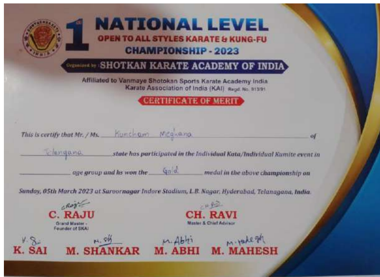
Figure 1: Ms. Kuncham Meghana received certificate in first National Level open to all styles Karate and Kung-Fu Championship- 2023 (Date: 05/03/2023)