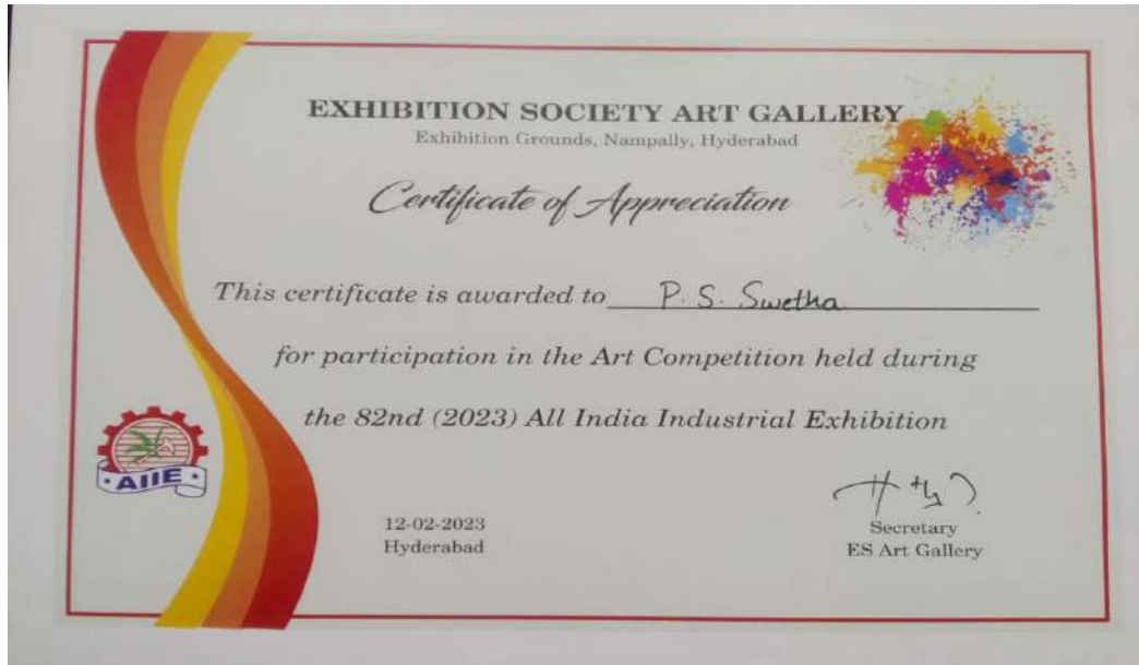
Figure 7: Ms. PS Swetha received certificate in 82 nd All India Industrial Exhibition- 2023 (Date: 12/02/2023)