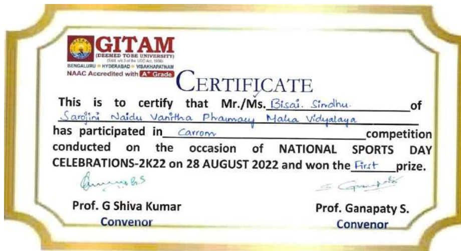
Figure 15: Ms. Bisai Sindhu received certificate in National sports day celebrations- 2k22 (Date: 28/08/2022)