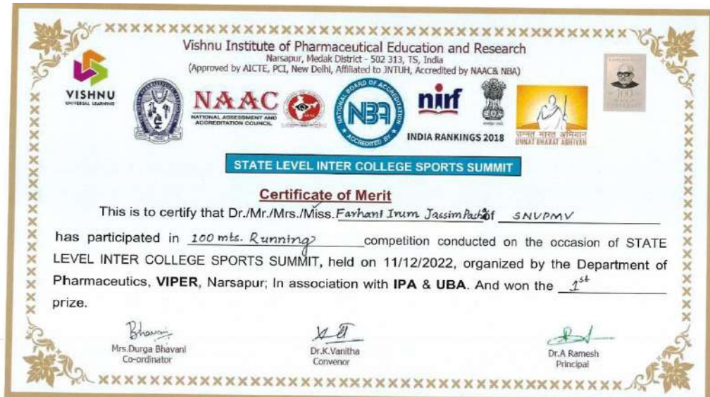
Figure 22: Ms. Farhani Irum Jassim Pasha received certificate in State level inter college sports summit- 2022 (Date: 11/12/2022)