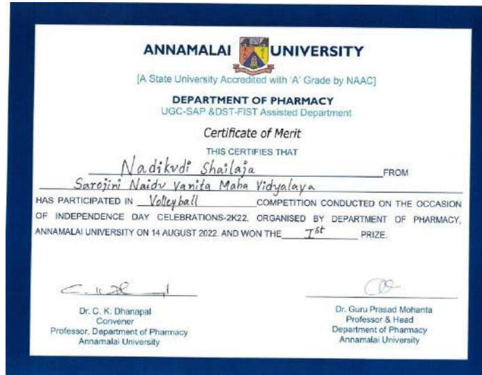
Figure 17: Ms Nadikudi Shailaja received certificate in Independence Day celebrations- 2k22 (Date: 14/08/2022)