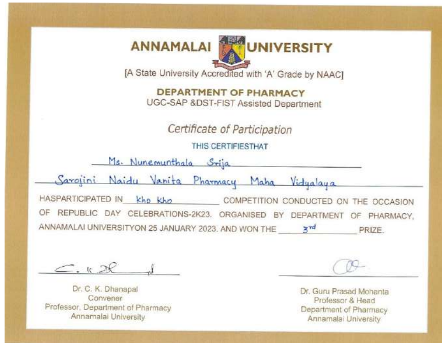
Figure 19: Ms Nunemunthala Srija received certificate in Republic day celebrations- 2k23 (Date: 25/01/2023)