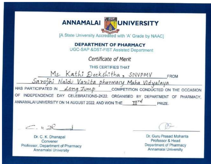
Figure 16: Ms Kathi Deekshitha received certificate in Independence Day celebrations- 2k22 (Date: 14/08/2022)