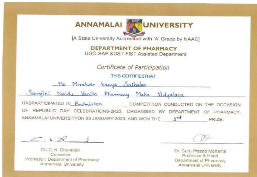
Figure 18: Ms Miralwar Kanya Saibaba received certificate in Republic day celebrations- 2k23 (Date: 25/01/2023)