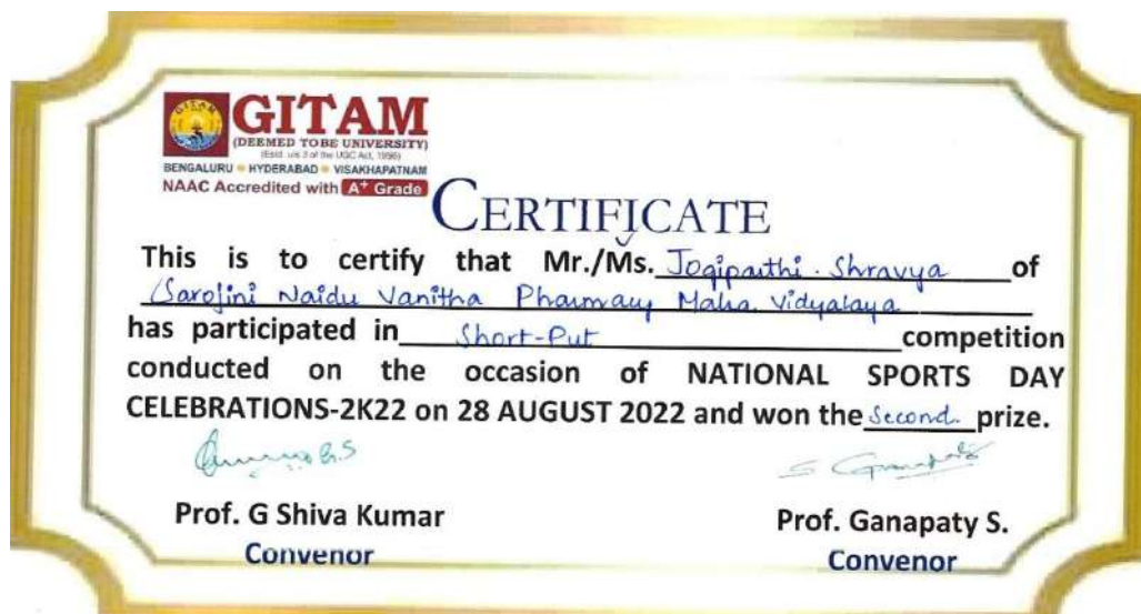
Figure 14: Ms. Jogiparthi Shravya received certificate in National sports day celebrations- 2k22 (Date: 28/08/2022)