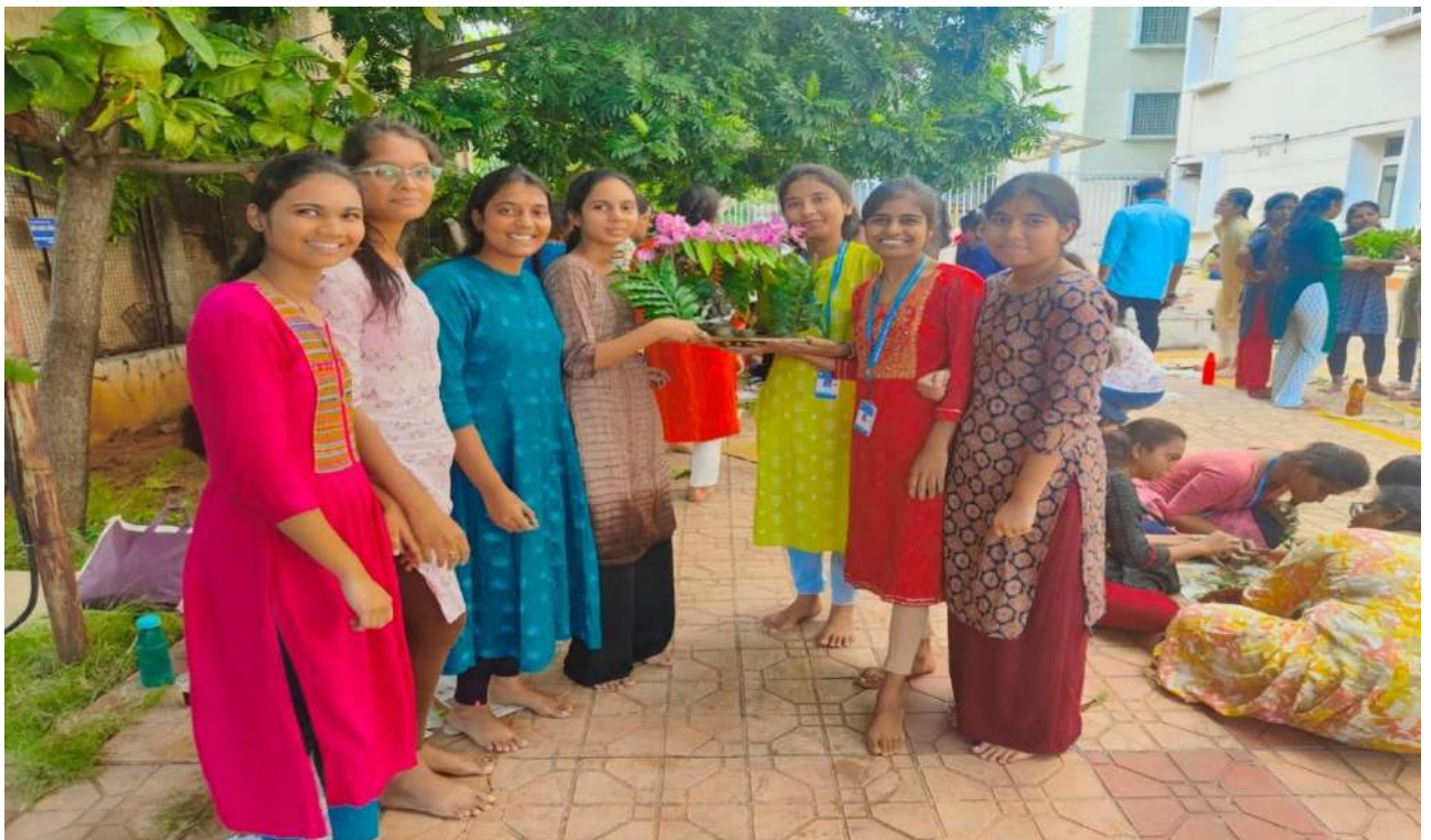
STUDENTS MAKING LORD GANESH IDOLS - GANESH CHATURTHI CELEBRATI