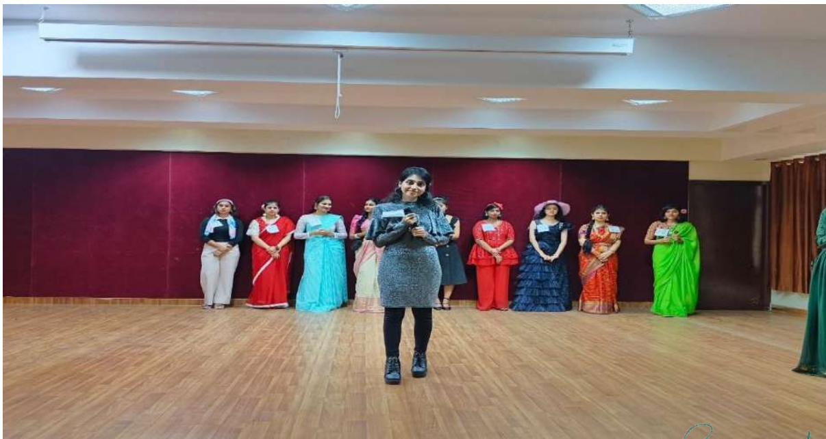
STUDENTS PARTICIPATING IN RETRO FASHION SHOW