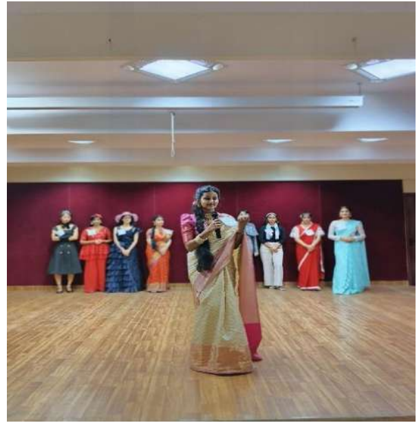
STUDENTS PARTICIPATING IN RETRO FASHION SHOW