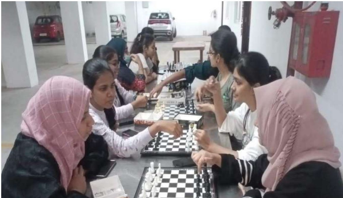
SPORTS WEEK - CHESS