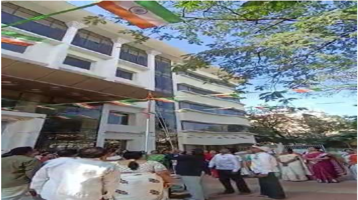
REPUBLIC DAY - FLAG HOSTING AND CARROMS