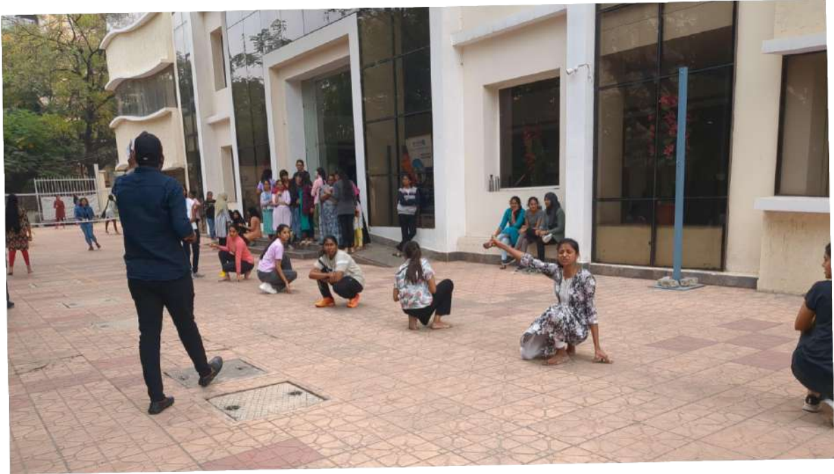
SPORTS WEEK - KHO KHO COMPETITION

ISO 9001: 2015 Certified Institution, NBA Accredited B. Pharmacy Course