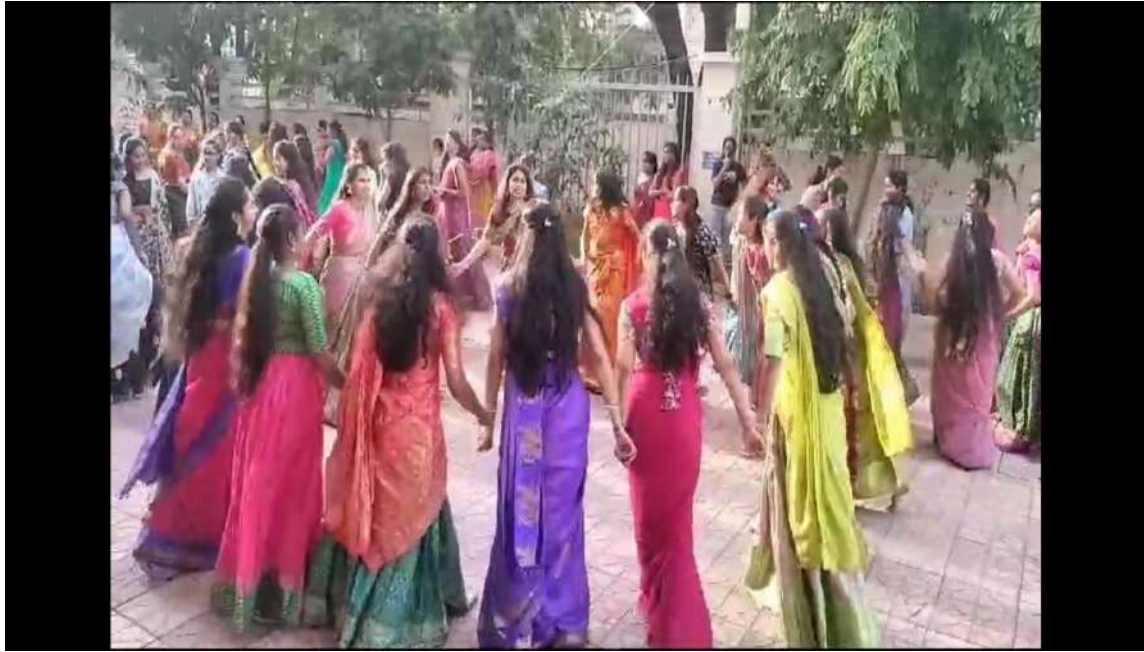
STUDENTS PARTICIPATING IN BATHUKAMMA FESTIVAL

ISO 9001: 2015 Certified Institution, NBA Accredited B. Pharmacy Course