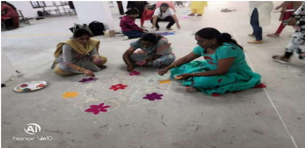
SPORTS WEEK – RANGOLI COMPETITION