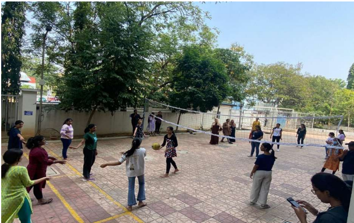
SPORTS WEEK- THROWBALL