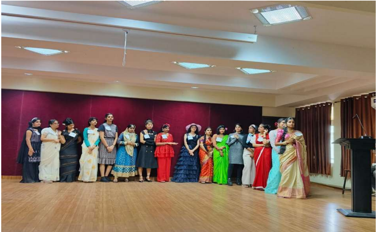
STUDENTS PARTICIPATING IN RETRO FASHION SHOW