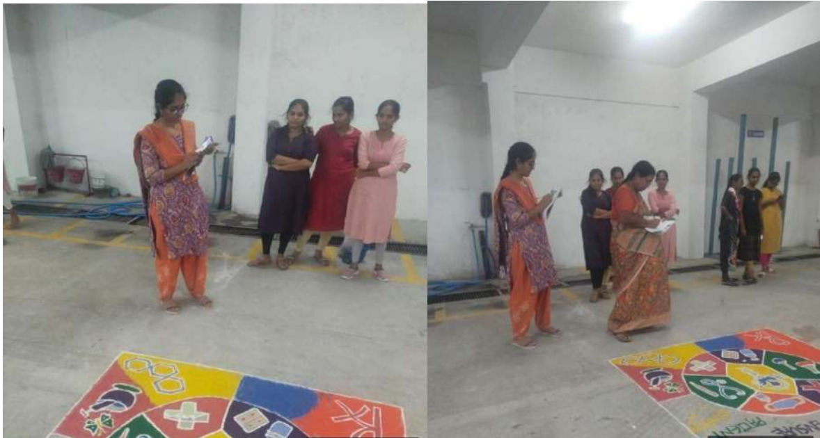
REPUBLIC DAY - RANGOLI COMPETITION