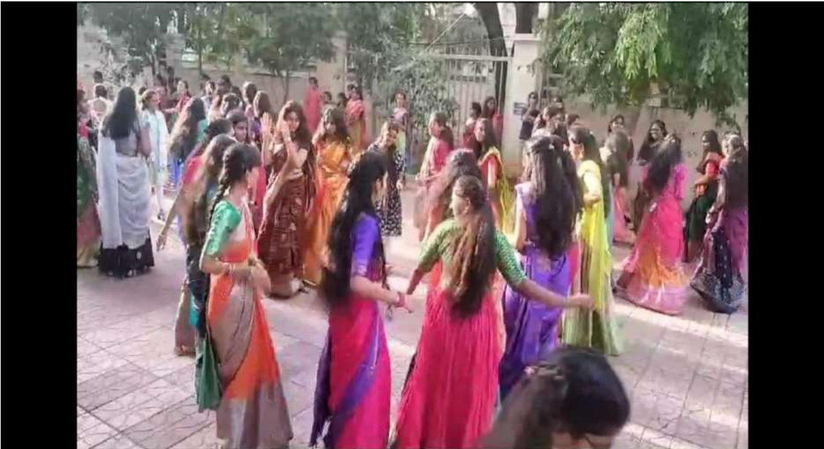
STUDENTS PARTICIPATING IN BATHUKAMMA FESTIVAL