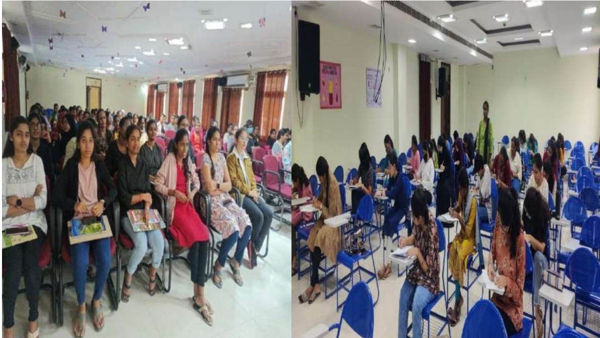
REPUBLIC DAY - ESSAY WRITING COMPETITION

ISO 9001: 2015 Certified Institution, NBA Accredited B. Pharmacy Course