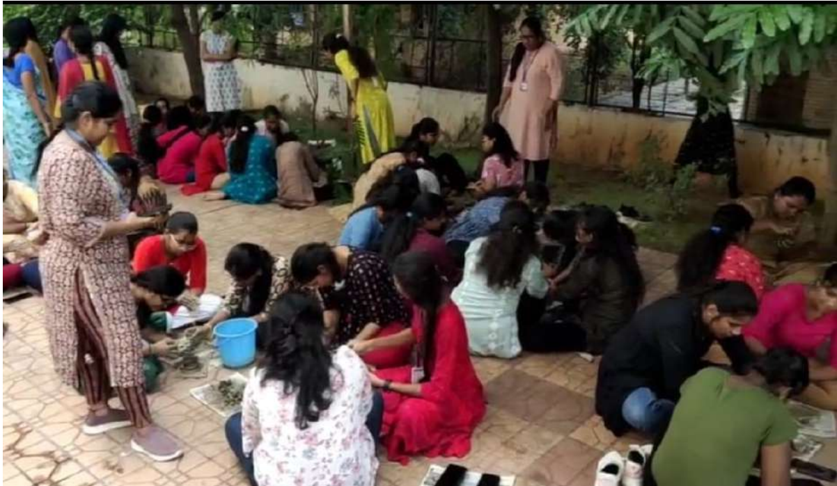
STUDENTS MAKING LORD GANESH IDOLS - GANESH CHATURTHI CELEBRATIONS

ISO 9001: 2015 Certified Institution, NBA Accredited B. Pharmacy Course