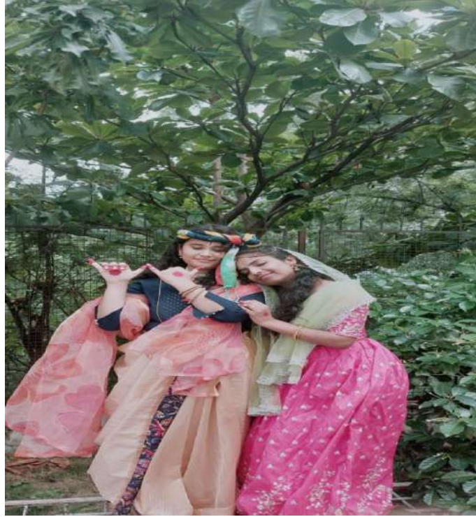
KRISHNA JANMASHTAMI CELEBRATIONS

ISO 9001: 2015 Certified Institution, NBA Accredited B. Pharmacy Course