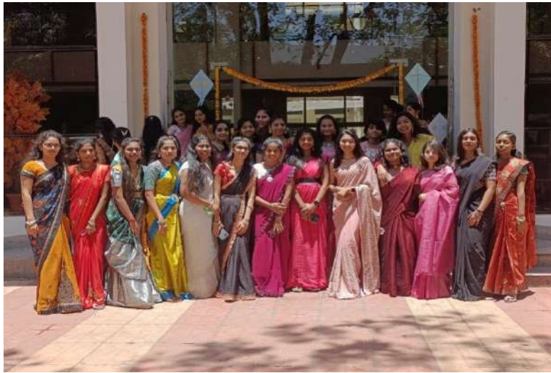
TRADITIONAL DAY CELEBRATIONS

ISO 9001: 2015 Certified Institution, NBA Accredited B. Pharmacy Course