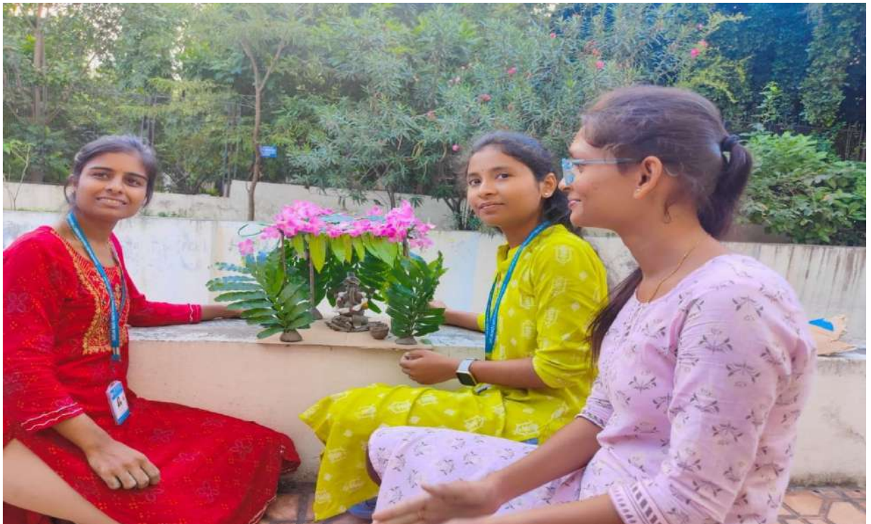
STUDENTS MAKING LORD GANESH IDOLS - GANESH CHATURTHI CELEBRATIONS