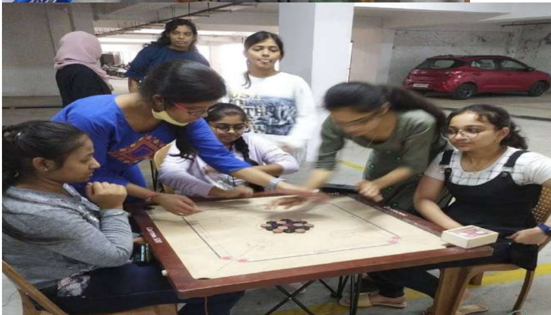
Sports week - carroms