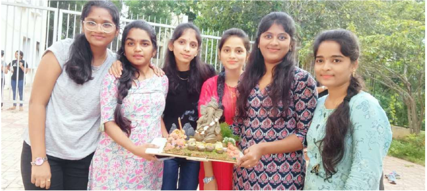
STUDENTS MAKING LORD GANESH IDOLS - GANESH CHATURTHI CELEBRATIONS

ISO 9001: 2015 Certified Institution, NBA Accredited B. Pharmacy Course