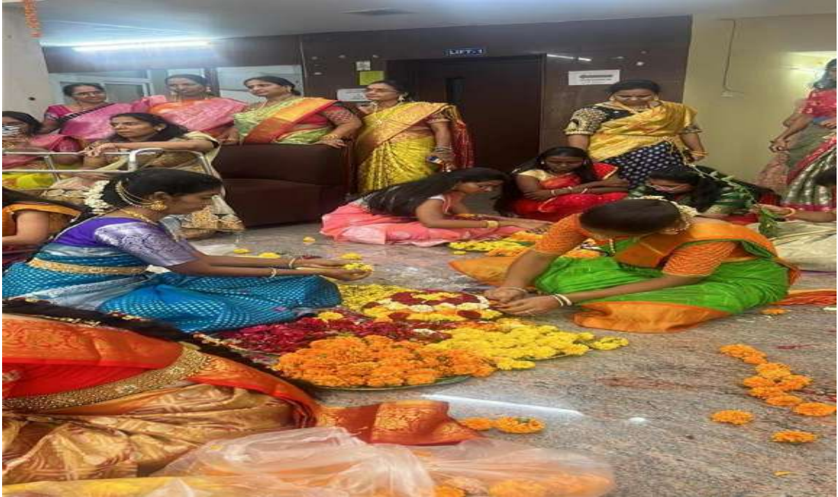
STUDENTS PARTICIPATING IN BATHUKAMMA FESTIVAL

ISO 9001: 2015 Certified Institution, NBA Accredited B. Pharmacy Course