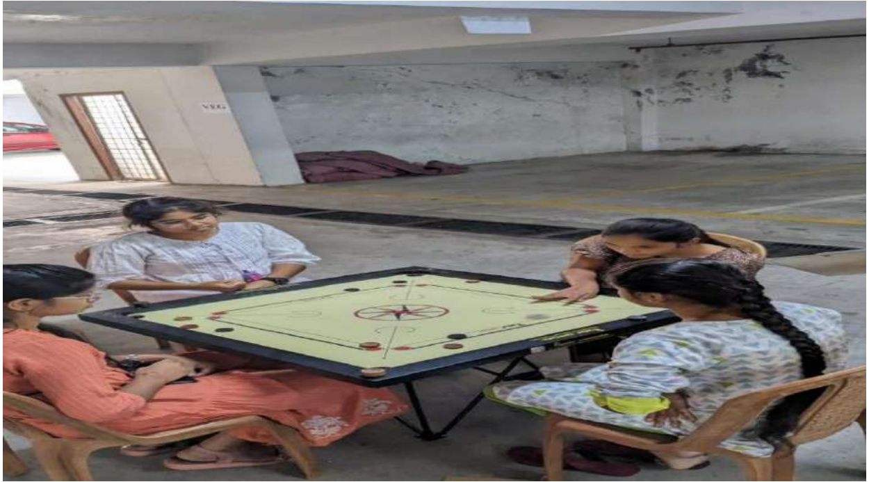
REPUBLIC DAY CARROMS COMPETITION

ISO 9001: 2015 Certified Institution, NBA Accredited B. Pharmacy Course