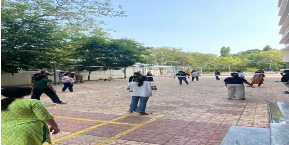
SPORTS WEEK – THROW BALL COMPETITION

ISO 9001: 2015 Certified Institution, NBA Accredited B. Pharmacy Course