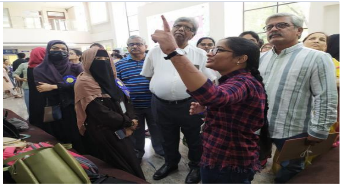
NATIONAL PHARMACY WEEK - THEME PAINTING

(Sponsored by the Exhibition Society), Tarnaka, Secunderabad Affiliated to Osmania University, Approved by AICTE & PCI ISO 9001: 2015 Certified Institution, NBA Accredited B. Pharmacy Course