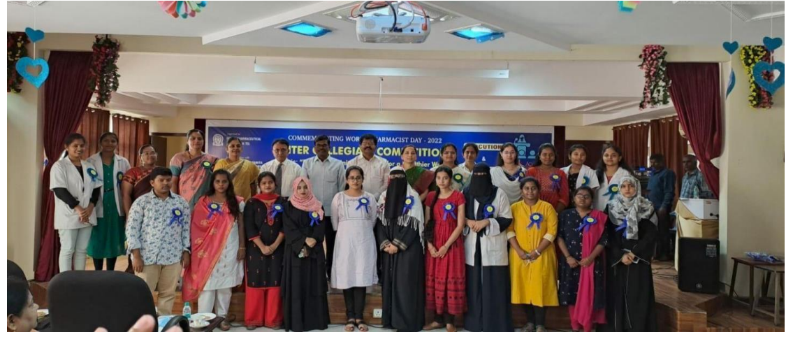
WORLD PHARMACIST DAY

Judges curiously and wonderfully interacted with the audience and the participants in the form of a debate on which profession is observed at the top level among all the health care professions.