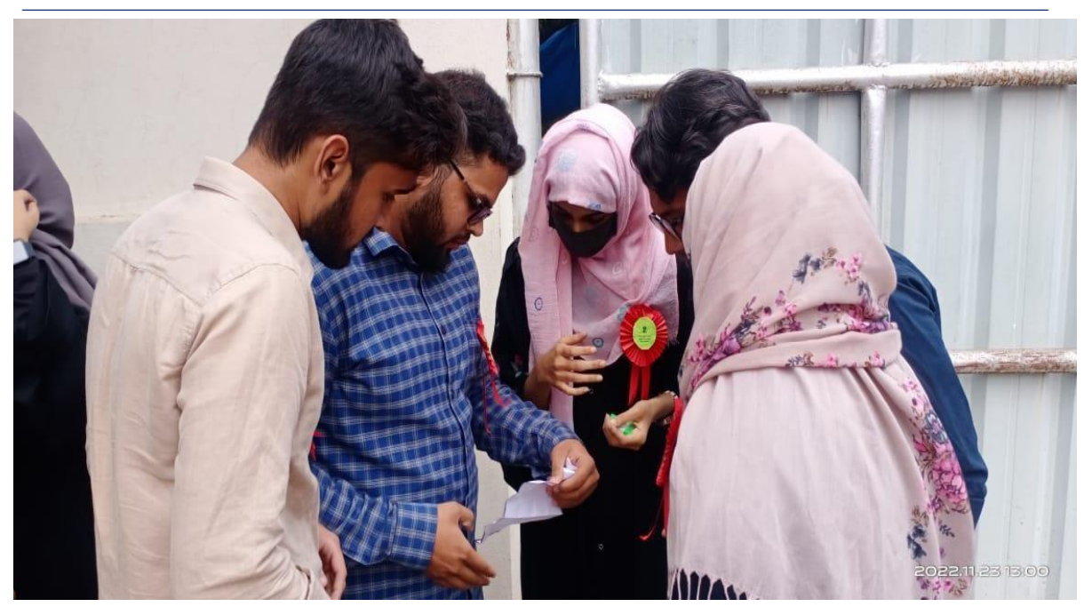
NATIONAL PHARMACY WEEK - TREASURE HUNT

(Sponsored by the Exhibition Society), Tarnaka, Secunderabad Affiliated to Osmania University, Approved by AICTE & PCI ISO 9001: 2015 Certified Institution, NBA Accredited B. Pharmacy Course