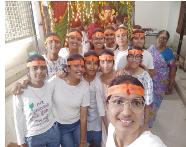
GANESH CHATURTHI CELEBRATIONS IN COLLEGE