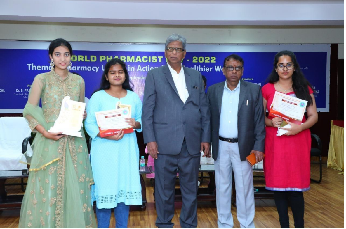
PHARMACY UNITED IN ACTION FOR HEALTHIER WORLD

The event continued with Prize distribution ceremony to the winners