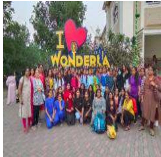
International women's day- Refreshment Tour