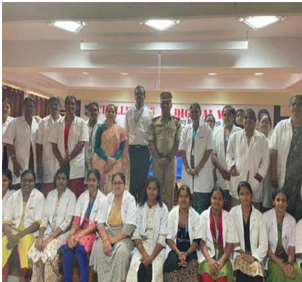
Challenges in Digital World