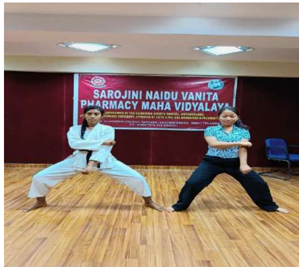
Self Defense Training

ISO 9001: 2015 Certified Institution, NBA Accredited B. Pharmacy Course