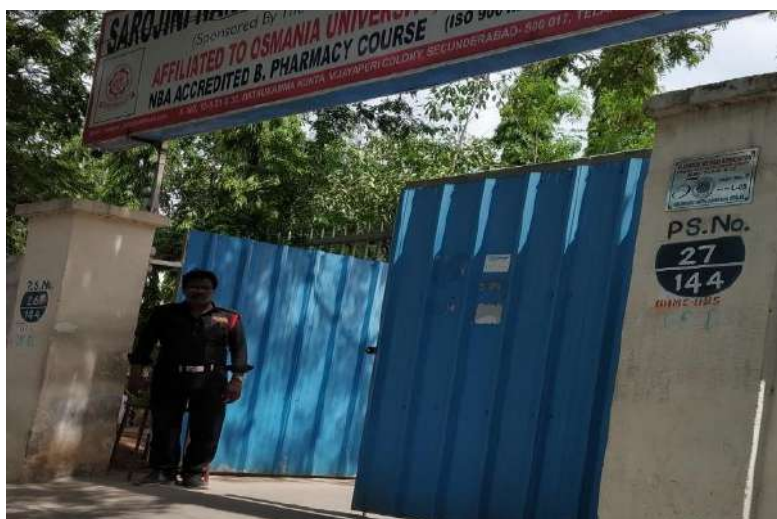
24-hour security guards

The college offers common rooms for faculty and student use so that they can socialise and engage in healthy recreation. In order to better serve our students, the campus has set up large, cosy common areas. This area has been planned to provide students with a place to unwind, learn, and engage in casual conversations during their free time. A few indoor games are included.