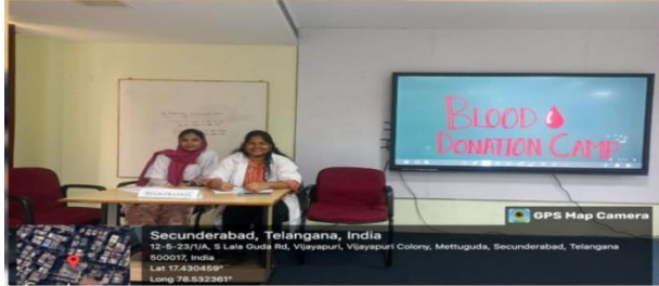
Secunderabad, Telangana, India 12-6-23/NA, 6 Lala Guda Rd, Vijayapuri, Vijayapuri Colony, Mettuguda, Secunderabad, Telangana, India 500017, India Lat 17.430495° Long 78.532361°