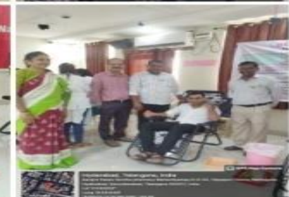
Secunderabad, Telangana, India 12-6-23/NA, 6 Lala Guda Rd, Vijayapuri, Vijayapuri Colony, Mettuguda, Secunderabad, Telangana, India 500017, India Lat 17.430495° Long 78.532361°