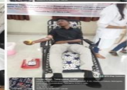
Secunderabad, Telangana, India 12-6-23/NA, 6 Lala Guda Rd, Vijayapuri, Vijayapuri Colony, Mettuguda, Secunderabad, Telangana, India 500017, India Lat 17.430495° Long 78.532361°