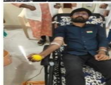
Secunderabad, Telangana, India 12-6-23/NA, 6 Lala Guda Rd, Vijayapuri, Vijayapuri Colony, Mettuguda, Secunderabad, Telangana, India 500017, India Lat 17.430495° Long 78.532361°