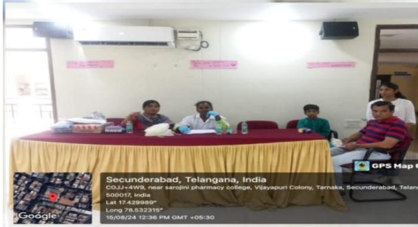
Secunderabad, Telangana, India COJ+4W9, near sarojini pharmacy college, Vijayapuri Colony, Tarnaka, Secunderabad, Telangana, India 500017, India Lat 17.429989° Long 78.532315° 10/08/24 12:36 PM GMT +05:30