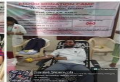
Secunderabad, Telangana, India 12-6-23/NA, 6 Lala Guda Rd, Vijayapuri, Vijayapuri Colony, Mettuguda, Secunderabad, Telangana, India 500017, India Lat 17.430495° Long 78.532361°