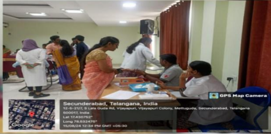
Secunderabad, Telangana, India 12-6-23/NA, 6 Lala Guda Rd, Vijayapuri, Vijayapuri Colony, Mettuguda, Secunderabad, Telangana, India 500017, India Lat 17.430752° Long 78.532479° 10/08/24 12:34 PM GMT +05:30