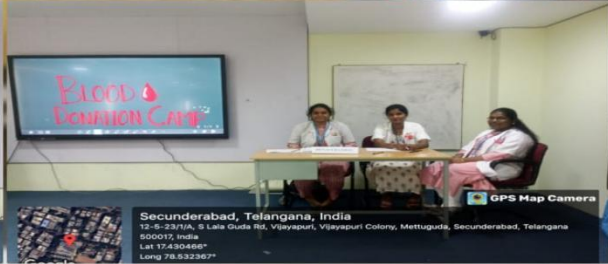
Secunderabad, Telangana, India 12-6-23/NA, 6 Lala Guda Rd, Vijayapuri, Vijayapuri Colony, Mettuguda, Secunderabad, Telangana, India 500017, India Lat 17.430495° Long 78.532361°