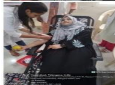
Secunderabad, Telangana, India 12-6-23/NA, 6 Lala Guda Rd, Vijayapuri, Vijayapuri Colony, Mettuguda, Secunderabad, Telangana, India 500017, India Lat 17.430495° Long 78.532361°