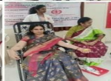
Secunderabad, Telangana, India 12-6-23/NA, 6 Lala Guda Rd, Vijayapuri, Vijayapuri Colony, Mettuguda, Secunderabad, Telangana, India 500017, India Lat 17.430495° Long 78.532361°