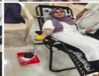
Secunderabad, Telangana, India 12-6-23/NA, 6 Lala Guda Rd, Vijayapuri, Vijayapuri Colony, Mettuguda, Secunderabad, Telangana, India 500017, India Lat 17.430495° Long 78.532361°