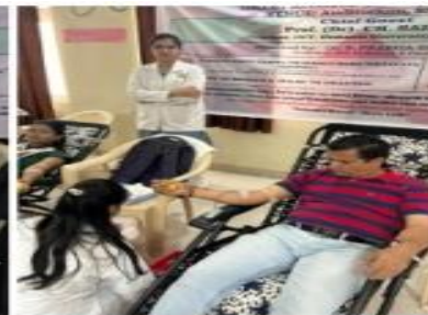
Secunderabad, Telangana, India 12-6-23/NA, 6 Lala Guda Rd, Vijayapuri, Vijayapuri Colony, Mettuguda, Secunderabad, Telangana, India 500017, India Lat 17.430495° Long 78.532361°