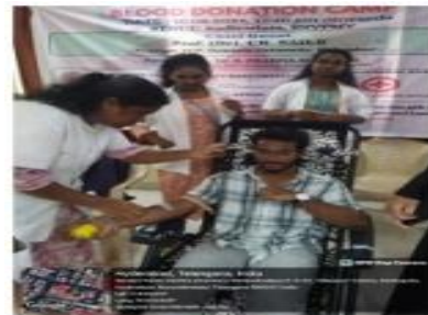
Secunderabad, Telangana, India 12-6-23/NA, 6 Lala Guda Rd, Vijayapuri, Vijayapuri Colony, Mettuguda, Secunderabad, Telangana, India 500017, India Lat 17.430495° Long 78.532361°