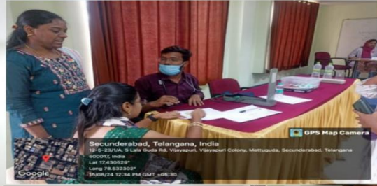
Secunderabad, Telangana, India 12-6-23/NA, 6 Lala Guda Rd, Vijayapuri, Vijayapuri Colony, Mettuguda, Secunderabad, Telangana, India 500017, India Lat 17.430829° Long 78.532302° 10/08/24 12:34 PM GMT +05:30