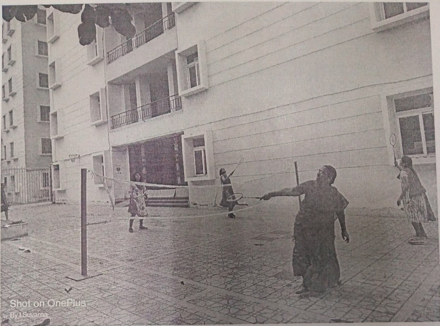
Shot on OnePlus By I.Suvarna