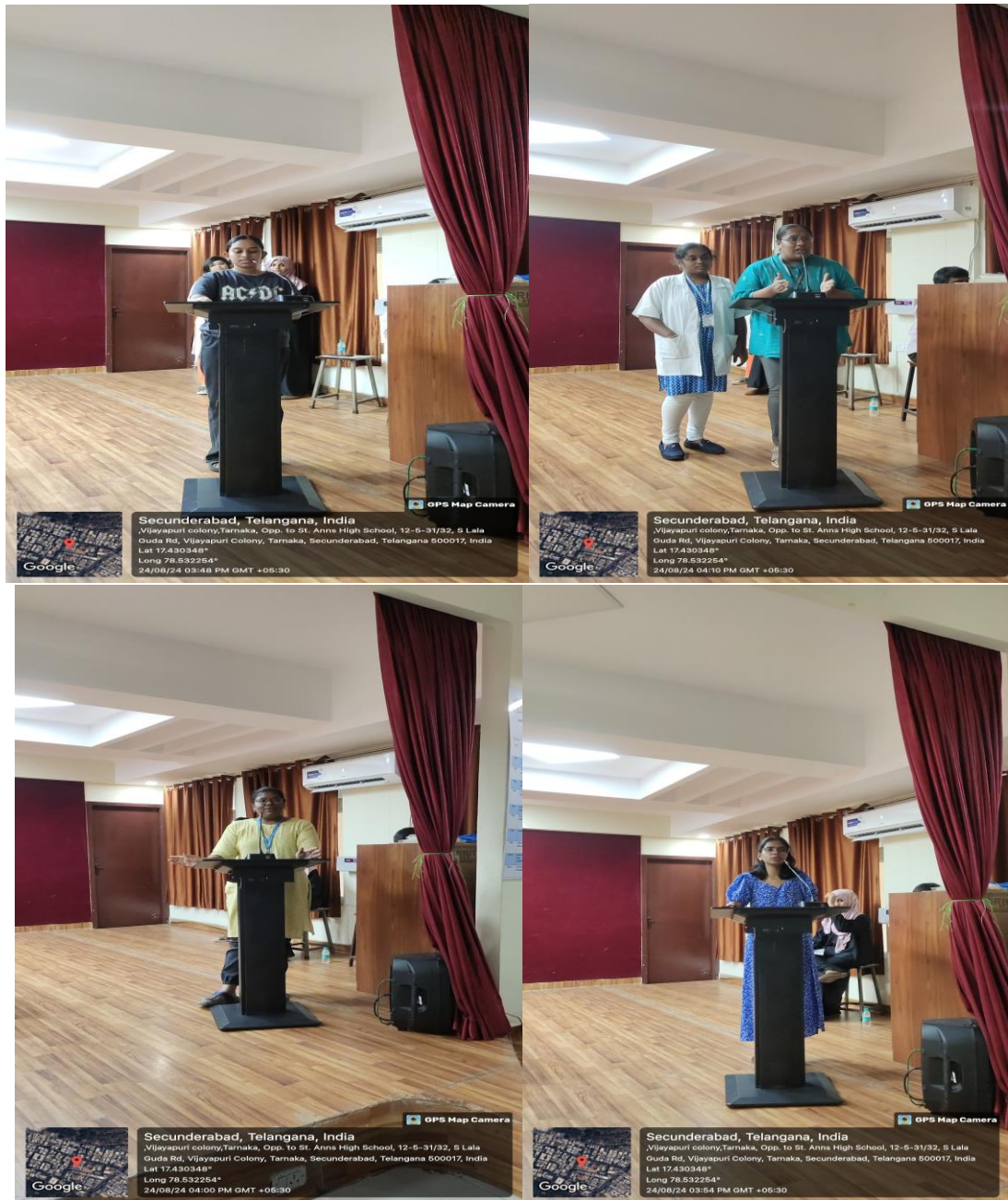
Speeches delivered by our students

(Sponsored by the Exhibition Society), Tamaka, Secunderabad Affiliated to Osmania University, Approved by AICTE & PCI ISO 9001: 2015 Certified Institution, NBA Accredited B. Pharmacy Course