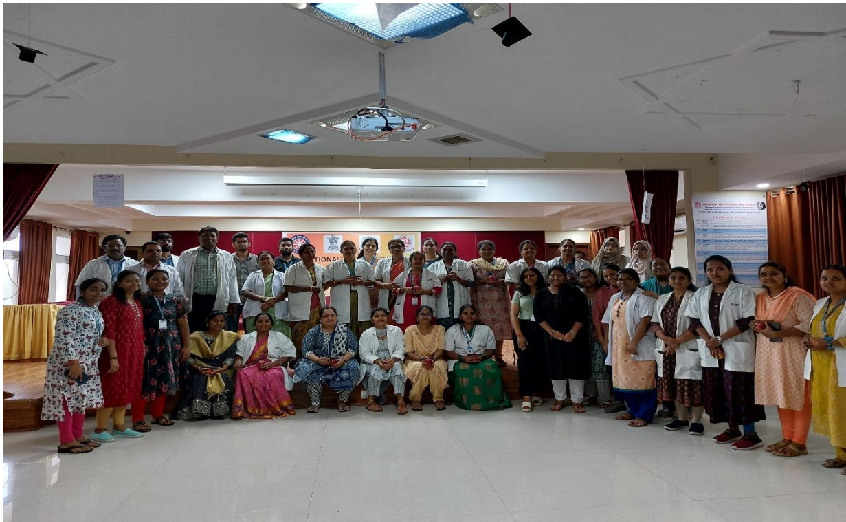
STUDENTS AND FACULTY