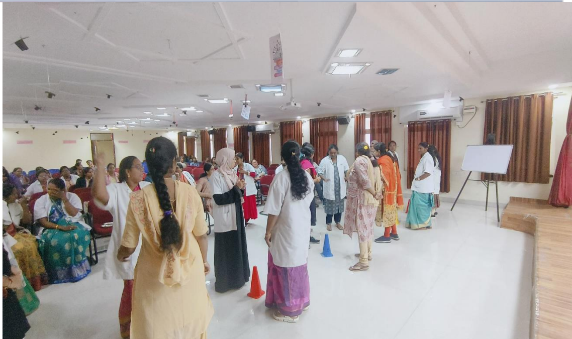
FACULTY PARTICIPATED IN FUN GAMES

(Sponsored by the Exhibition Society), Tamaka, Secunderabad Affiliated to Osmania University, Approved by AICTE & PCI ISO 9001: 2015 Certified Institution, NBA Accredited B. Pharmacy Course