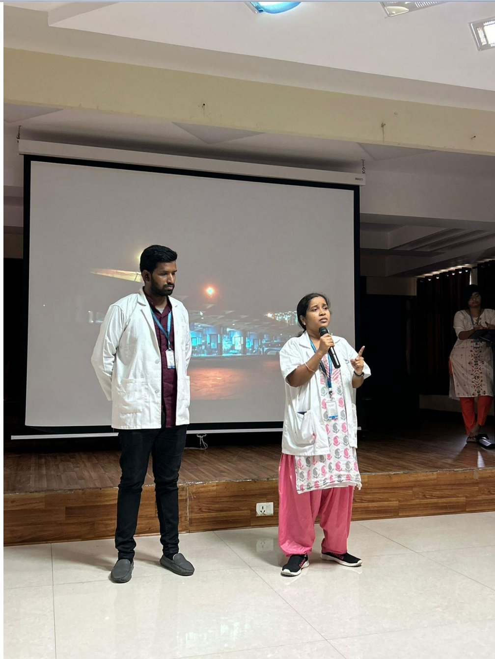
Interactive sessions by our faculty

(Sponsored by the Exhibition Society), Tamaka, Secunderabad Affiliated to Osmania University, Approved by AICTE & PCI ISO 9001: 2015 Certified Institution, NBA Accredited B. Pharmacy Course