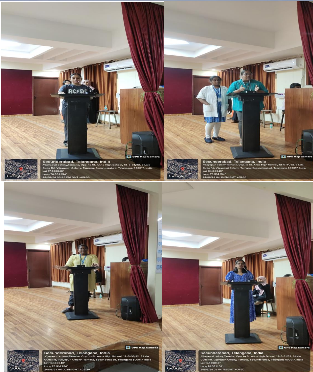
Speeches delivered by our students

ISO 9001: 2015 Certified Institution, NBA Accredited B. Pharmacy Course