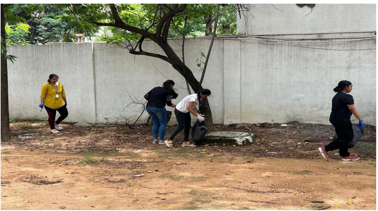
Pharm D 3<sup>rd</sup> Years involved actively in collecting the plastic

(Sponsored by the Exhibition Society), Tarnaka, Secunderabad Affiliated to Osmania University, Approved by AICTE & PCI ISO 9001: 2015 Certified Institution, NBA Accredited B. Pharmacy Course