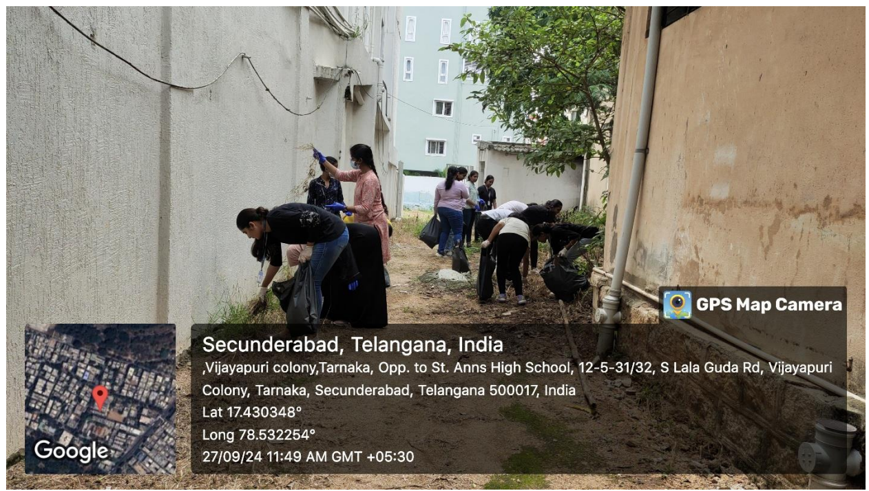
Volunteers clearing the plastic and obstacles on the way to the ground