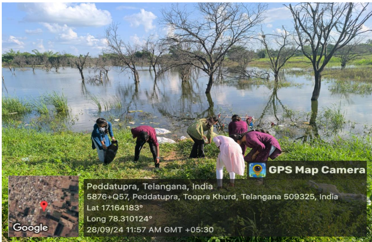
NSS Volunteers worked actively in the cleaning of lake shore