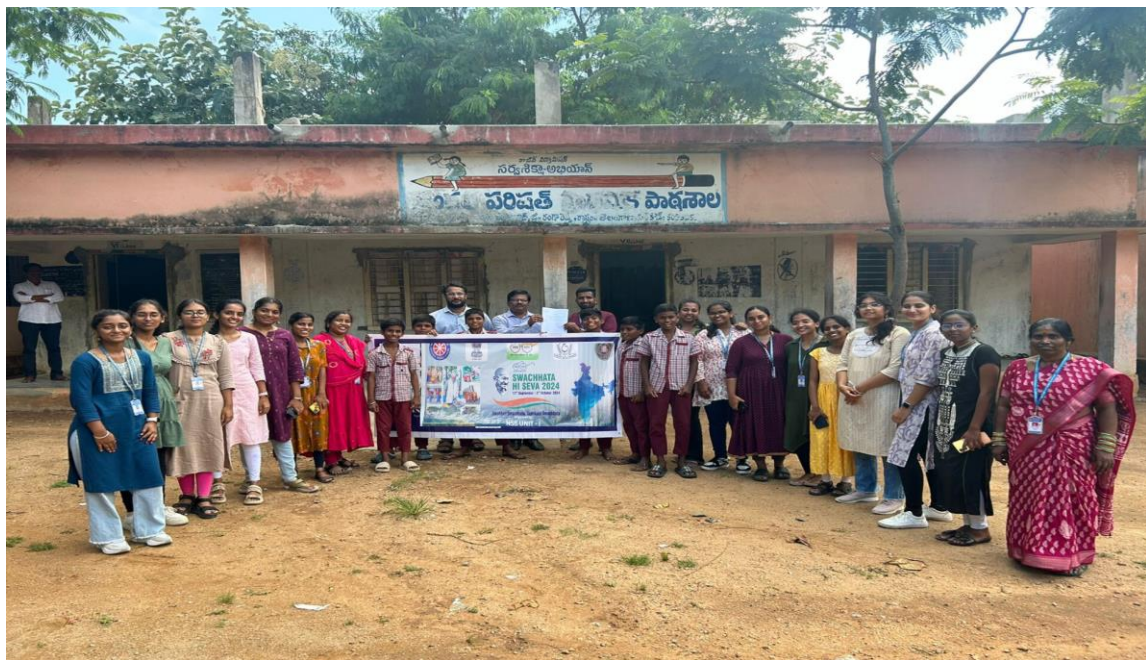
Received Letter of Appreciation for the sincere efforts of our NSS - Team