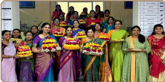
BATHUKAMMA AND DANDIYA CELEBRATIONS ON 5th OCTOBER 2024.