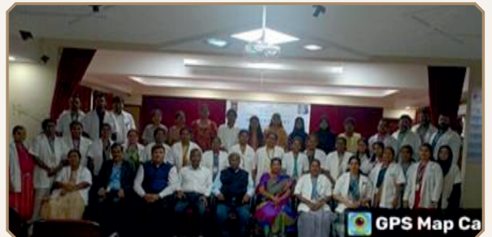
ORIENTATION DAY PROGRAM FOR M. PHARM & PHARM. D (PB) ON 19th OCTOBER 2024.