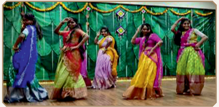
NEW YEAR CELEBRATIONS ON 31st DECEMBER, 2024.