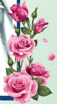
Smt. Sarojini Naidu