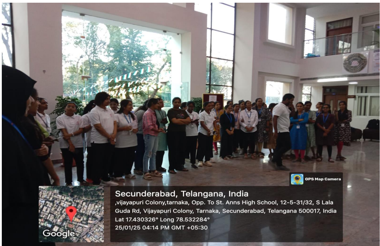
Voters day celebrations