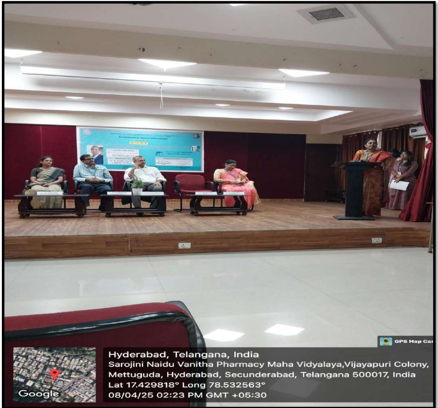
Welcome Address by Principal

Affiliated to Osmania University, Approved by PCI-New Delhi NBA Accredited B. Pharmacy Course, Accredited A+ grade by NAAC