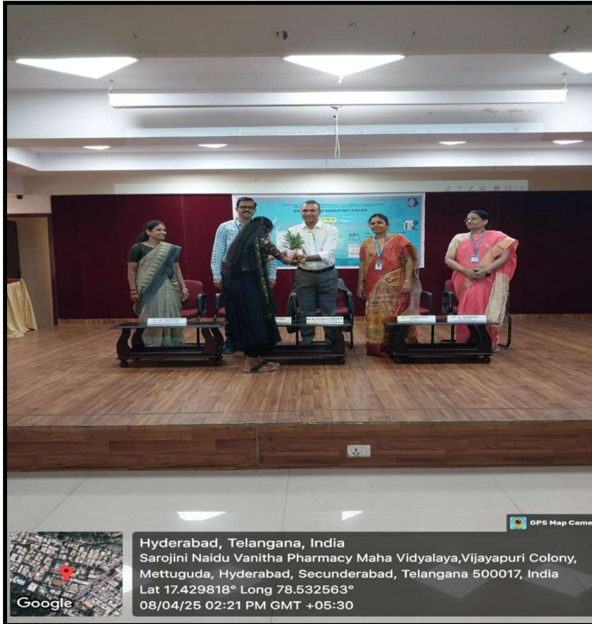
Eco –greetings to Speaker

Affiliated to Osmania University, Approved by PCI-New Delhi NBA Accredited B. Pharmacy Course, Accredited A+ grade by NAAC