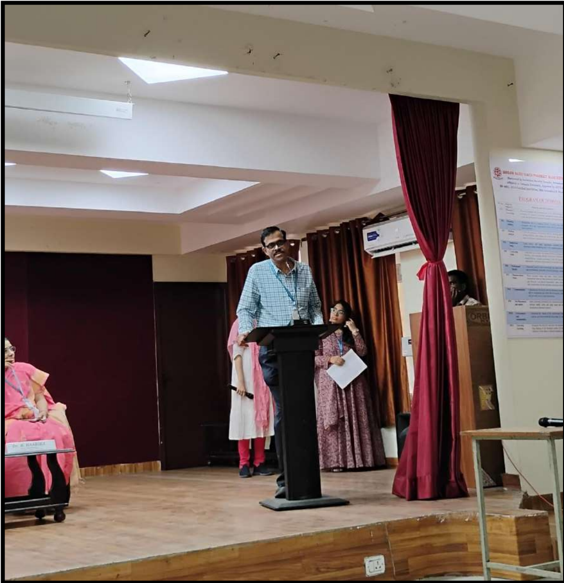
Address by Director

Affiliated to Osmania University, Approved by PCI-New Delhi NBA Accredited B. Pharmacy Course, Accredited A+ grade by NAAC