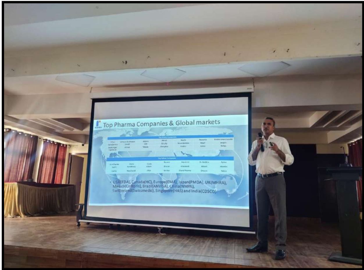
Address by Speaker

Affiliated to Osmania University, Approved by PCI-New Delhi NBA Accredited B. Pharmacy Course, Accredited A+ grade by NAAC