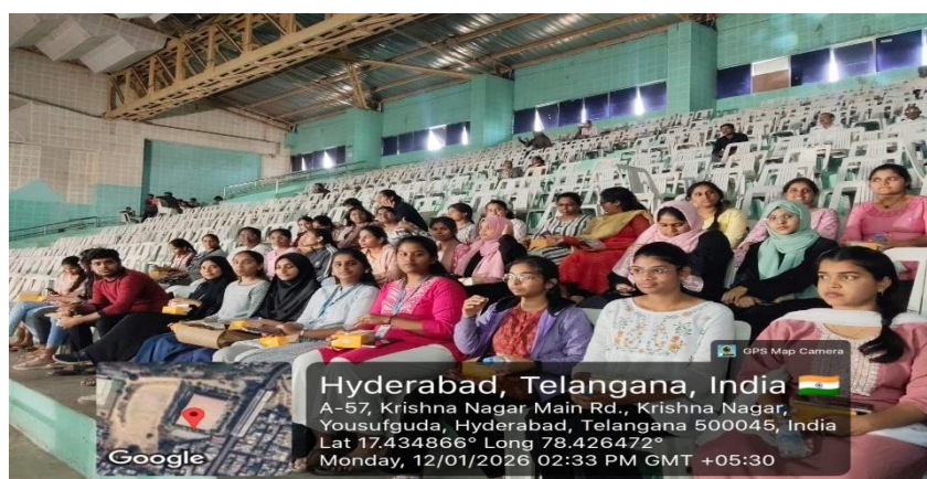
NSS Volunteers at the stadium for the event