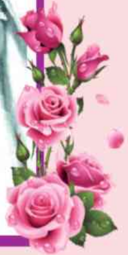
Smt. Sarojini Naidu