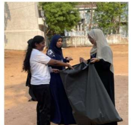
Plantation Drive @Lobby