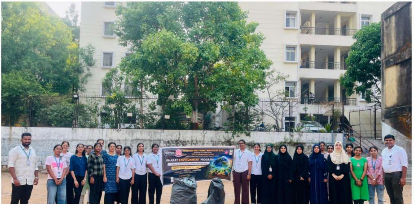
Plastic Free Drive @ SNVPMV Campus and Ground