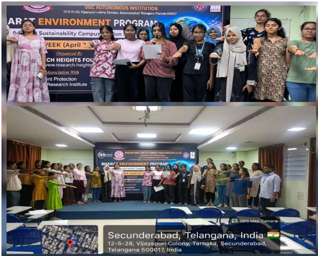
Sustainability Pledge by NSS Volunteers with NSS Programme Officer

NBA Accredited B. Pharmacy Course, Accredited A+ grade by NAAC