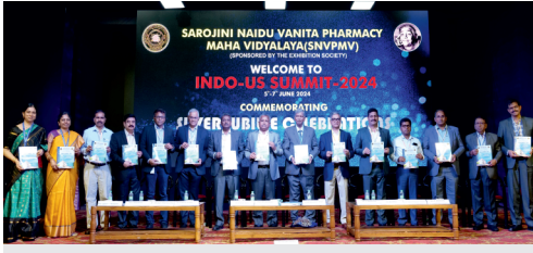
Inauguration of Indo-US Summit 2024