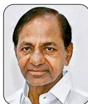
Shri K. Chandrashekar Rao Former Chief Minister Government of Telangana

"SNVPMV is a leading Institute known for academic excellence and research driven education. With strong infrastructure, expert faculty, and advanced labs, it fosters Innovation and Hands-on learning. It focus on empowering Women in Pharmaceutical Sciences helps shape Professionals ready to impact Global Healthcare."