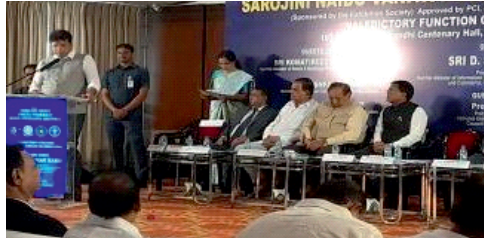
Shri D. Sridhar Babu, Telangana IT Minister, President- Exhibition Society Addressing the valedictory function of Indo-US Summit - 2024