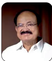
Shri M. Venkaiah Naidu Former Vice President of India,

"India has grown from its ancient medical roots to become the world's third largest drug producer. Its pharmaceutical industry supports global health by supplying affordable medicines to over 200 countries.